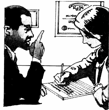
Get referrals from friends and take advantage of free consultations.

ney can decide the best course of action to relieve or solve your problem.